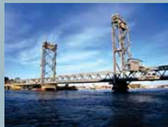
2013 Memorial Bridge.