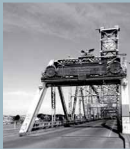
Plaques and sculpture in their original location on the south portal of the 1923 Bridge, c. 2003.

In 1924, bronze plaques and sculptural elements were added to the south portal of the 1923 Memorial Bridge. These included a plaque honoring World War I sailors and soldiers, United States and New Hampshire seals, and an eagle with outstretched wings. They were reinstalled on the 2013 bridge.