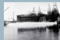
Launching of caisson for north pier, 1921.

The extreme tides and currents of the Piscataqua River made the construction of Memorial Bridge particularly challenging. Contractors for the substructure, Holbrook, Cabot & Rollins, used watertight caissons for the extensive underwater excavation necessary to construct the deep bridge piers.