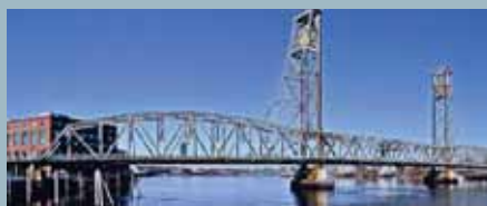
Historic: Memorial Bridge, constructed 1923.

The first Memorial Bridge was constructed between 1920 and 1923 and demolished in 2012. It was the second bridge built across the deep and fast tidal waters of Portsmouth Harbor.