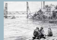
"The New Bridge." Charles Woodbury magazine print, 1925.

To permit the passage of tall boats, Memorial Bridge's center lift span rose between its flanking towers. Steel pulleys, or sheaves, at the tops of the towers carried steel cables which connected the ends of the lift span to counterweights that exactly balanced the weight of the span. Electric motors raised and lowered the counterbalanced span using a separate set of cables.