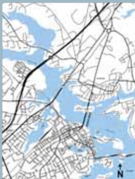
Map showing the Piscataqua River bridges between Portsmouth, NH and Kittery, ME. Map: City of Portsmouth

The opening of the original Memorial Bridge brought the newly created U.S. Route and its interstate traffic through the center of Portsmouth. As Memorial Bridge became a vital Eastern Seaboard transportation link, additional bridges across Portsmouth Harbor became necessary.